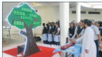
Inauguration of Palmarius