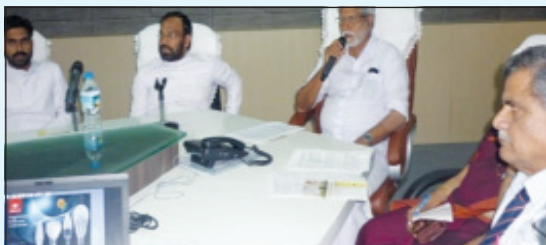
Panel discussion on Action Plan for Energy Conservation in Kodakara Panchayath