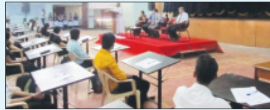
IBS Campus Recruitment at Sahridaya