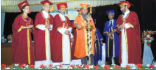
Convocation - 2009-'13 batch