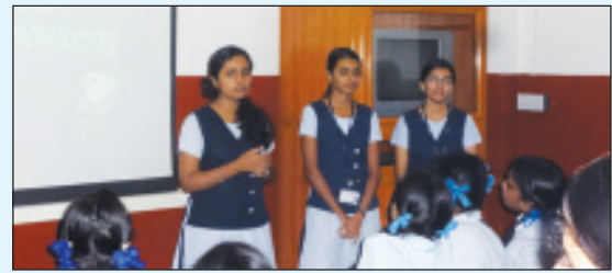
Talk on "Conserving our Environment"