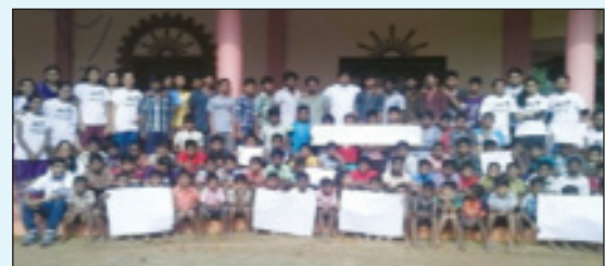
Visit to Balabhavan