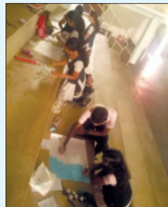
Poster-Making Competition on "Technology Combats Natural Calamities"