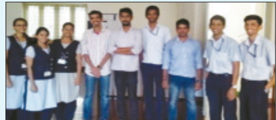
Workshop on web designing