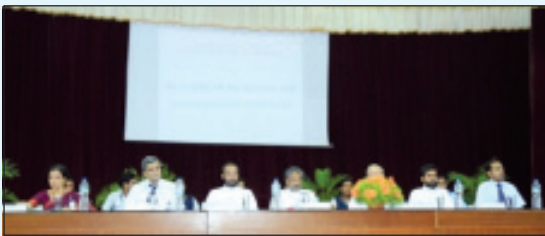
Inauguration of the PG Hostel