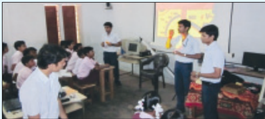
One day Workshop on "Electricity"