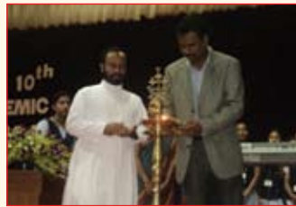
Inauguration of 10 th Academic Council