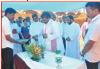
Laying of foundation stone