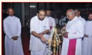
College Day Inauguration