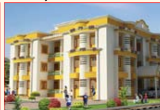
Proposed Staff Quarters