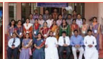
Infosys campus connect