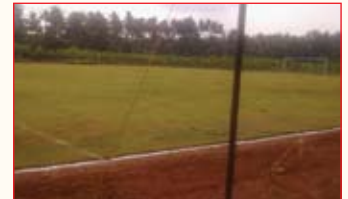
New football ground with grass turf