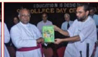
Releasing of “THE JACKFRUIT”