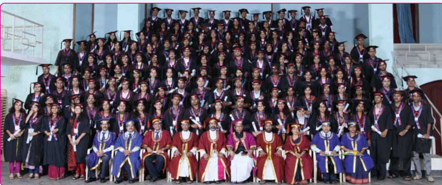
The convocation of 4th batch (2009 pass out) was conducted on 6th November 2010. Dr. Cyriac Thomas, Member Govt of India National Commission for Minority Institution delivered the Convocation Address.